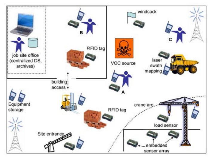
Fig. 1: The Intelligent Job Site

of bricks) and record its location. Outside the building, worker A nears a VOC (Volatile Organic Compound) source; worker A's sensor can monitor the level of the hazardous material and use the network to warn others if the concentration surpasses a threshold. A wind sock can provide wind information to augment this notification.